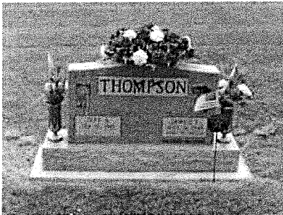
Added by RWCNAC